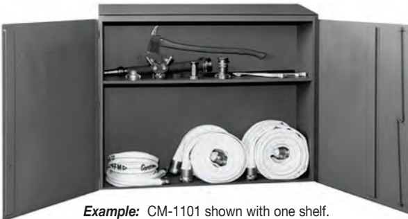
Example: CM-1101 shown with one shelf. Accessories not available.