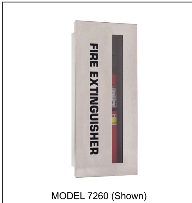
MODEL 7260 (Shown)