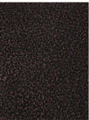
Aged Bronze (AG)