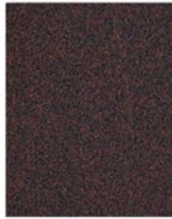
Copper Texture (CT)