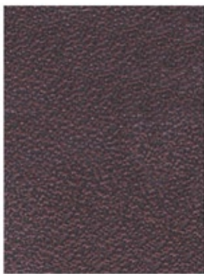
Aged Copper (AC)