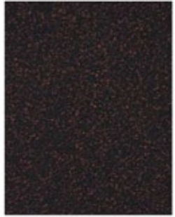
Dark Roast (DR)