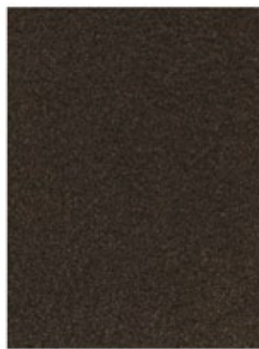
Antiqued Bronze (AN)