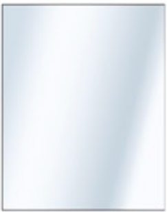
Brite Bond Chrome (BB)