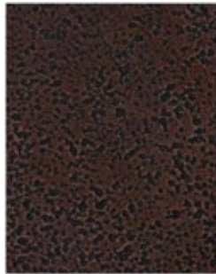
Copper Clad (CC)