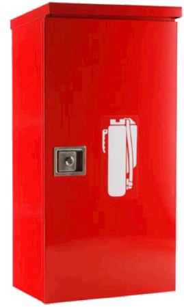
HDOC - STYLE 2