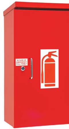
HDOC - STYLE 1