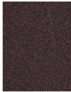
Copper Texture (CT)