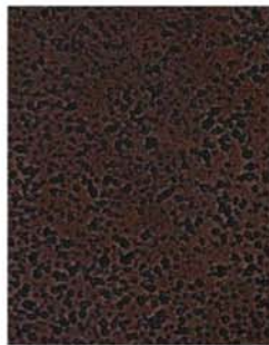
Copper Clad (CC)