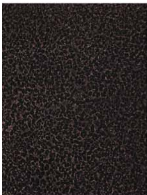
Oil Rubbed Bronze (ORB)