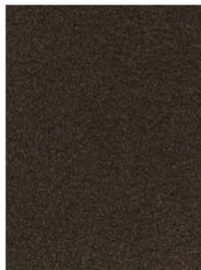
Antiqued Bronze (AN)