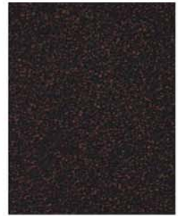
Dark Roast (DR)