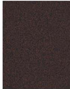
Weathered Brown (WB)