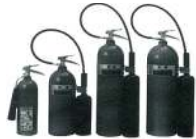
CD5 CD10 CD15 CD20